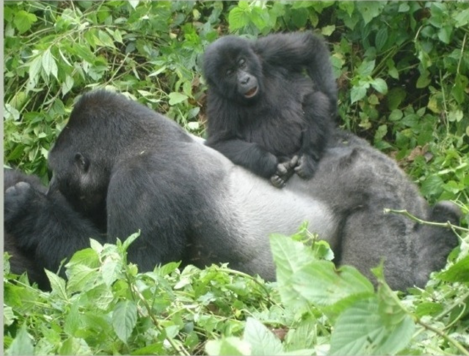
Gorillas are truly gentle giants.